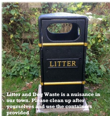
Litter and Dog Waste is a nuisance in our town. Please clean up after yourselves and use the containers provided