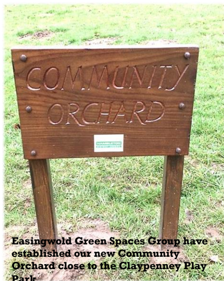
Easingwold Green Spaces Group have established our new Community Orchard close to the Claypenney Play Park