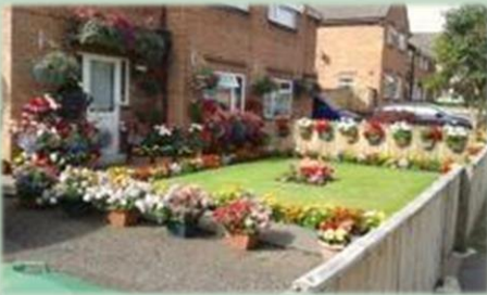
2016 Winner – Best Garden: 11 West Avenue

Easingwold in Bloom – the beauty of our town writ large