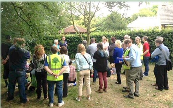
During 2016 the Easingwold Green Spaces Group has worked in many of our open areas. Amongst other things they have created a Community Orchard close to Millfields woods.