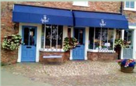
2016 Winner – Best Commercial Flowers Tea-Hee!