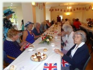
Easingwold enjoyed the Queen's 90th Birthday very much!