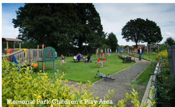
Memorial Park Children's Play Area