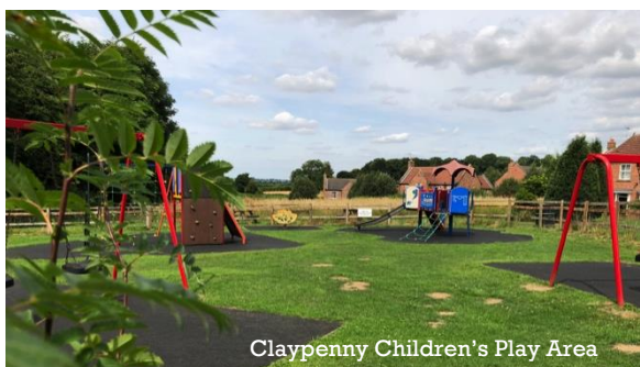
Claypenny Children's Play Area

Much of our news from this committee has been highlighted elsewhere in this newsletter – especially the extensive work that has been underway in the Millfields Park/Open Space. We do hope that you will all take the time to look at our information packages and respond to our questionnaire. When we have assessed your responses then they will be considered as the Committee recommends to the Council what aspects it should invest in and how.