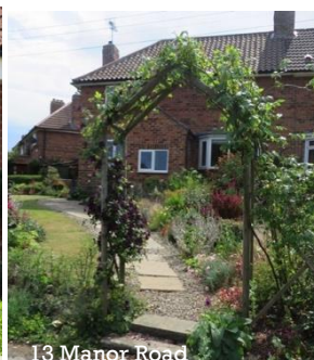
13 Manor Road