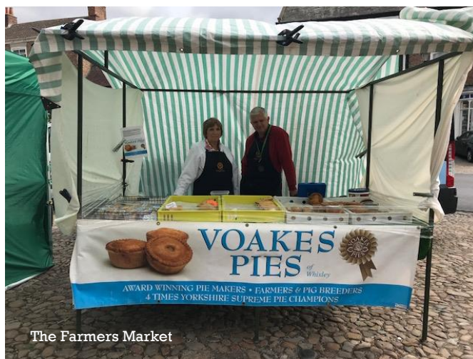
The Farmers Market