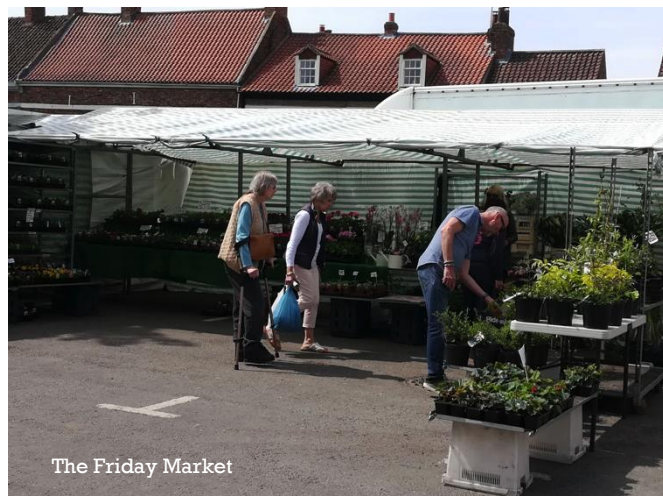
The Friday Market