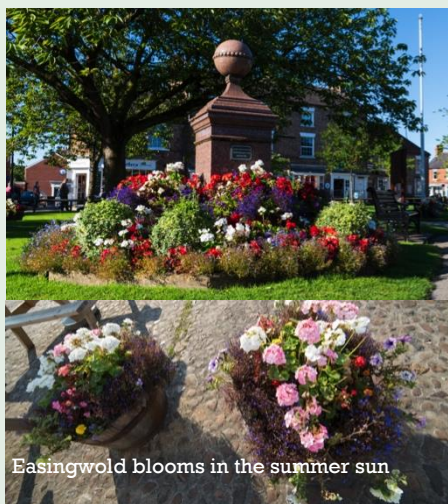
Easingwold blooms in the summer sun