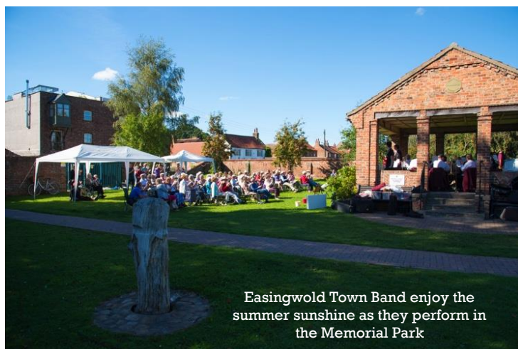
Easingwold Town Band enjoy the summer sunshine as they perform in the Memorial Park

We have been working hard on the Town Council website in conjunction with Puro Design. It includes many new features and will hopefully be simpler to operate and improve. We will be launching it after the Millfields Consultation has been completed to assure that the change over does not affect that activity.