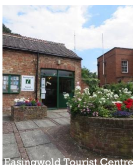
Easingwold Tourist Centre

The Easingwold and Villages Action for Dementia Alliance has organised a series of awareness events across the area. Training has been delivered by Dementia Forward to many local businesses and has been well attended and received.