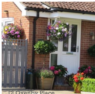
12 Oxenby Place