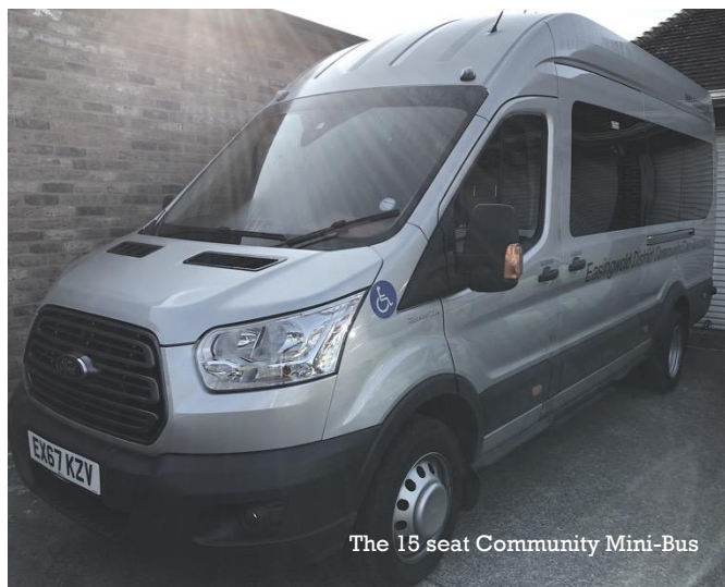
The 15 seat Community Mini-Bus

The Town Council is delighted to see the Easingwold & District Community Care Association (EDCCA) community minibs, for which it is a co-sponsor, come into such active service. It will often be seen around the town, picking up passengers and taking them on their adventures. EDCCA are providing regular days out to many locations. The 15-seat minibs with a wheel chair lift is available for hire to voluntary and community groups and schools. Should you be interested in using it, then please call 01347 822598 or email carscheme@edcca.org.uk .