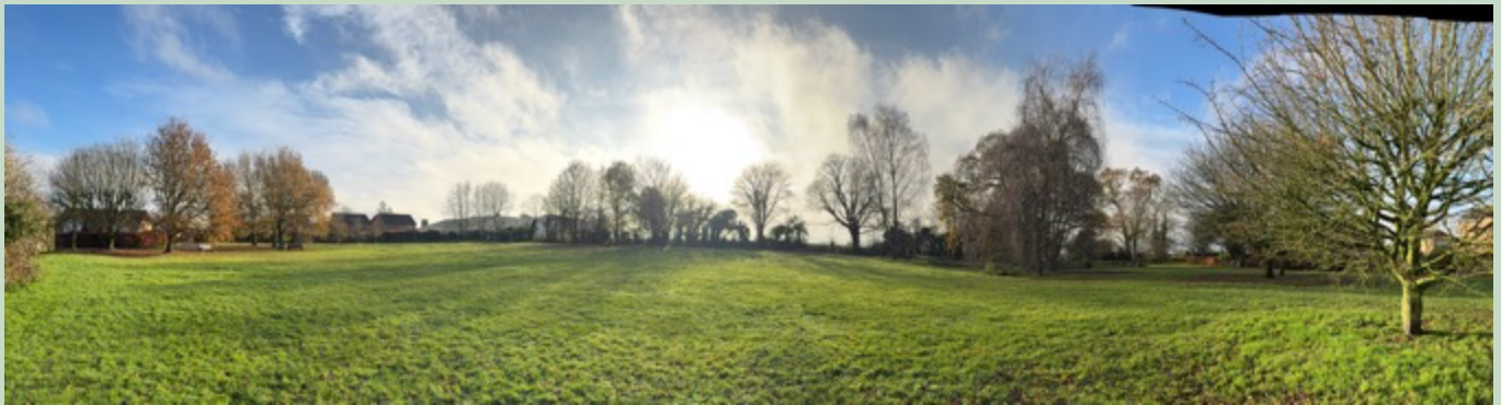
Chase Garth Park in the December Sunshine

In the year since May 2025 the town has continued to grow and thrive, and the Town Council has worked hard in fulfilling its part in this evolution. There have been trials and tribulations as we went along, but overall, we feel that steady progress is being made. We believe that Easingwold remains one of the best small towns in North Yorkshire to live in, work in, or visit.